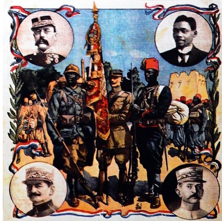
Senegalese Riflemen with decorated flag, showing Blaise Diagne in upper right, along with Generals Faidherbe, Mangin, and Marchand, July 1919

The 161,000 Senegalese Riflemen who joined the colonial army during the First World War did so either by recruitment or by forcible conscription. Throughout the war, French officials would often ask villages to supply quotas of enlistees. Some volunteered, for a variety of reasons - to satisfy or serve their family, assert their dignity, to see combat or prove their manhood, or they joined because everyone in their age cohort was going and they felt they had no choice but to go along. Others, however, were fearful of what recruitment might mean. Some actively resisted, and many fled the conscriptors who swept through French West Africa. At times, recruiters would show up and find an entire village empty of its young men.