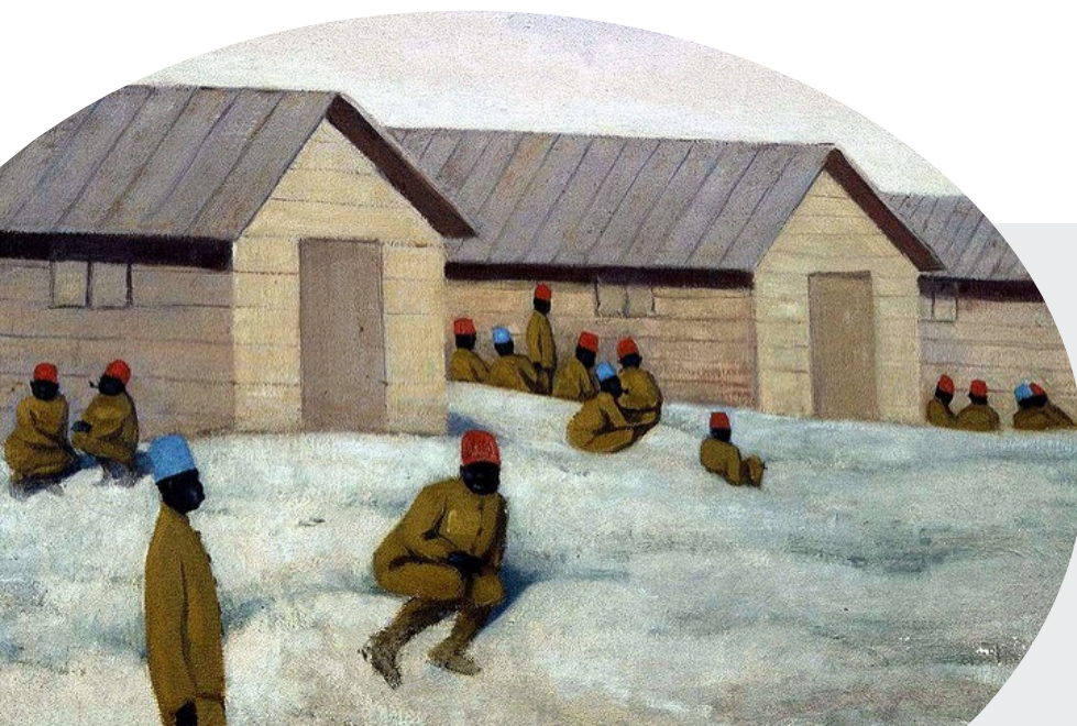
Painting by Felix Vallotton, providing a desolate glimpse into a wintry camp at Mailly, in central France, where African men prepared to go to the front, 1917

Because they were unused to the harsh winters of northern France and Belgium (where the fighting on the Western Front occurred) French military authorities also saw to it that colonial conscripts from Africa would take leave in camps established for them in the south of France, in a practice called hivernage , or wintering. When on leave, they walked the streets of French towns such as Marseilles or Nice, encountering French civilians. At times, they drank coffee, greeted townspeople, made friends, visited prostitutes, and sometimes even found work - as in the case of Ndiaga Niang, who worked in a bakery in the town of Faviere. Senegalese soldiers could be met with curiosity by French civilians, and sometimes even celebrated for their contributions to the war effort. However, such encounters with French people were also often characterized by racism and discrimination as well.