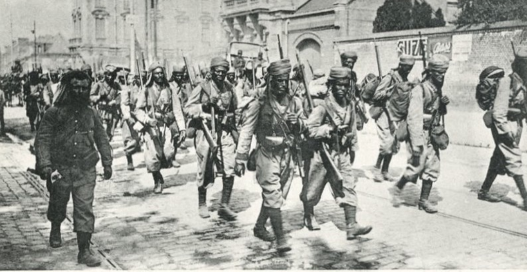
Senegalese Riflemen march through village in Europe, 1914-1918