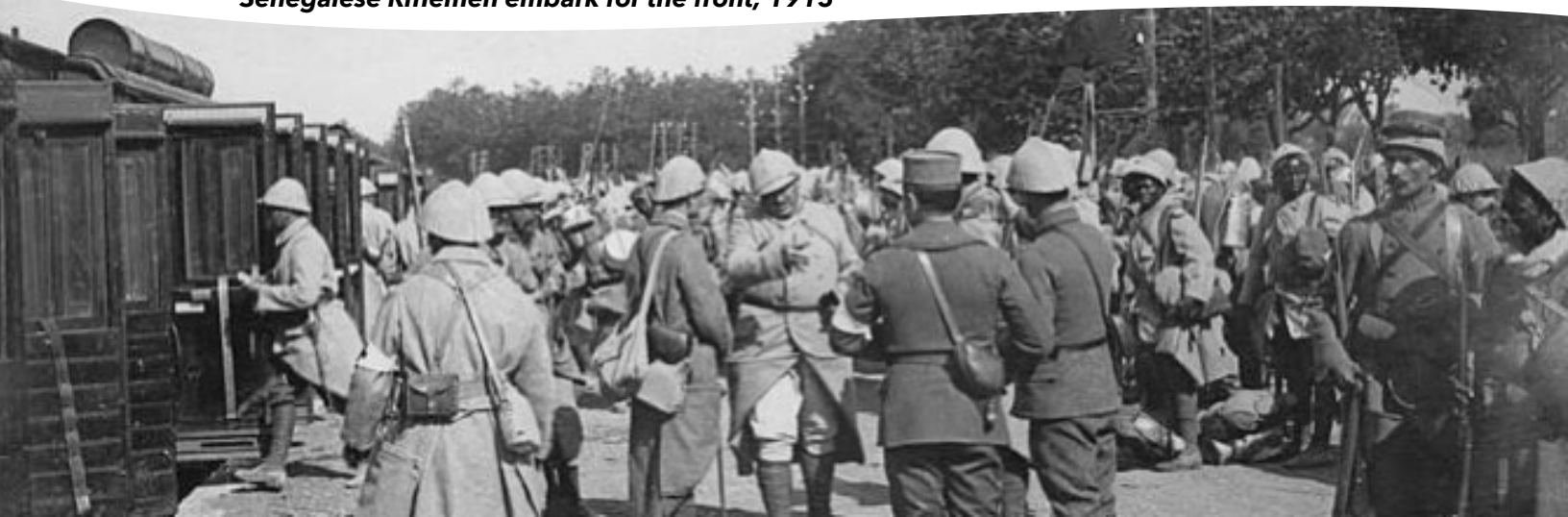
Senegalese Riflemen embark for the front, 1915

During a brilliantly successful six-month recruiting tour of French West Africa in 1918, Diagne attempted to reduce fears and present military service as a duty - both in exchange for enhanced rights, or as a vehicle for securing more extensive rights in the future. Aware of the law passed in 1916 and the status of originaires , some sujet villages demanded similar rights in exchange for service. Diagne convinced people to sign up by promising that if they served in the war as tirailleurs , afterwards the law might change and they would gain French Citizenship, and all the rights and privileges attached to that status. In the spring and summer of 1918, over 63,000 more West Africans joined the French military, with nearly a quarter of new recruits being considered "volunteers." While many were still conscripted, the campaign far surpassed the expectations of French officials. It also attached far more meaning to the war for both originaires and sujet than had been the case before.