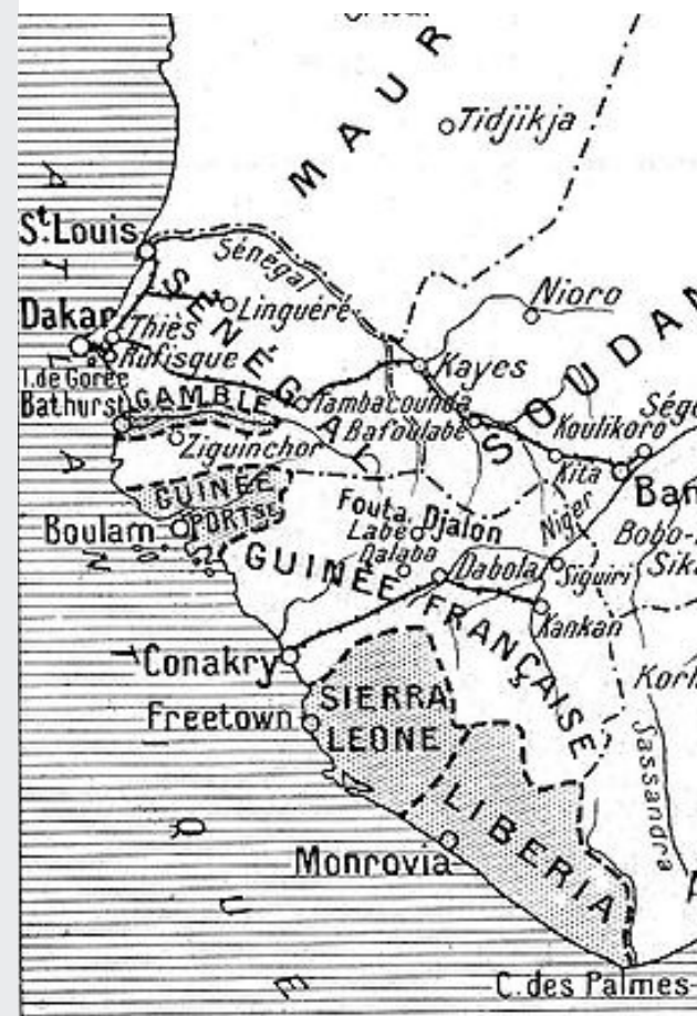
Map of French Senegal, with the cities of the Four Communes – St. Louis, Goree, Rufisque, and Dakar