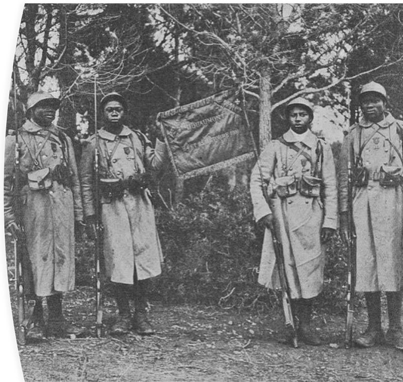
Pennant of the 43rd battalion of Senegalese riflemen bearing the inscription Douaumont, 1916

Over the course of the war, nearly 140,000 tirailleurs sénégalais were sent to the Western Front. There, they fought in some of the most well-known battles of the war, for example the Battle of the Somme in 1916. That same year they participated at the Battle of Verdun, including in the recapture of Fort de Douaumont - a vital defensive position - from German forces in October. Tirailleurs sénégalais also fought at Chemin des Dames in the spring of 1917, an attempt to launch a massive offensive that French officials hoped would end the war. Wet trenches, cold, dug-in German forces, and delays caused the offensive to fail and resulted in high casualties.