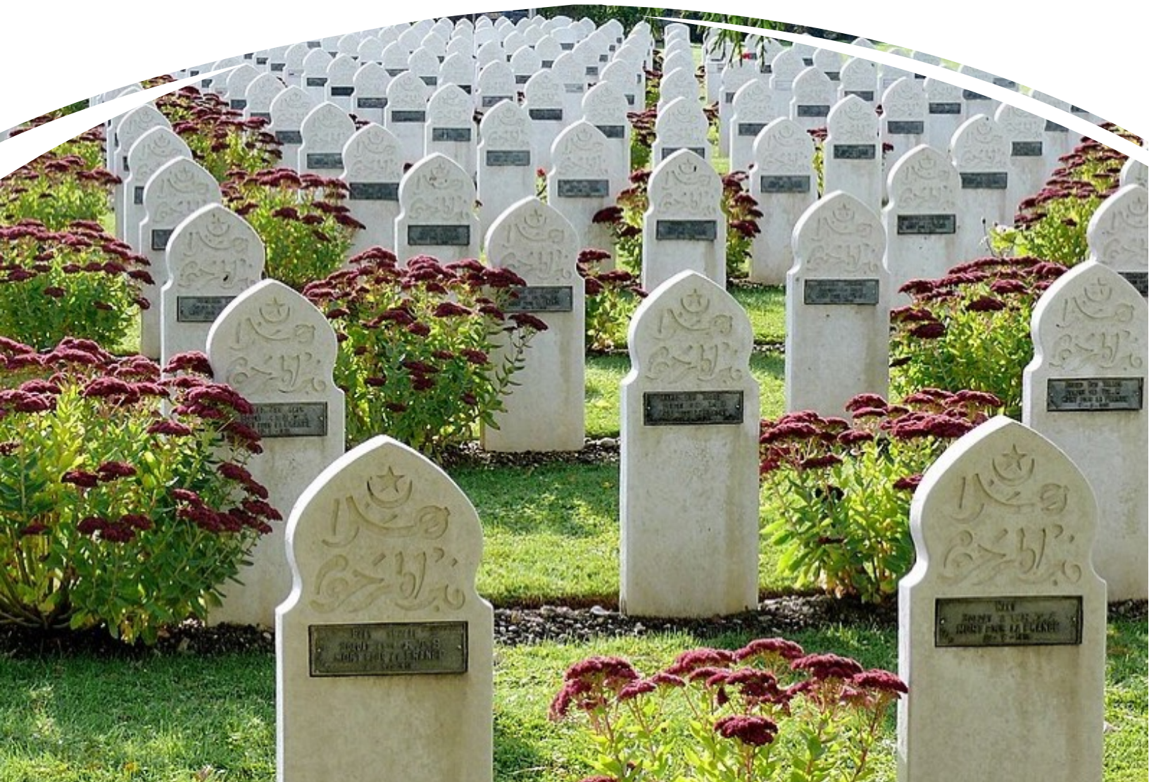
Muslim area of the national cemetery in Amiens (Saint-Acheul), with a soldier from the 45 th regiment of the tirailleurs sénégalais , killed in the Battle of the Somme