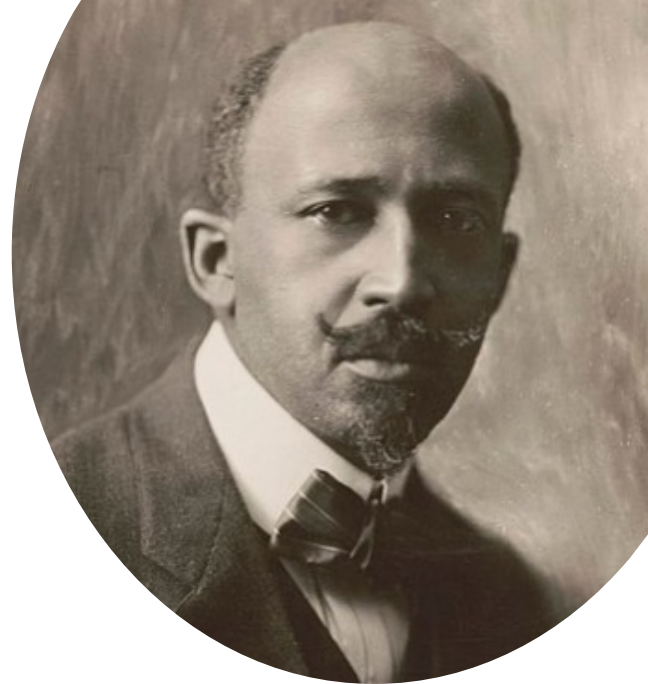
Du Bois, 1918

First: land. Today Africa is being enslaved by the theft of her land and natural resources. A century ago black men owned all but a morsel of South Africa. The Dutch and English came, and today 1,250,000 whites own 264,000,000 acres, leaving only 21,000,000 acres for 4,500,000 natives. Finally, to make assurance doubly sure, the Union of South Africa has refused natives even the right to buy land. This is a deliberate attempt to force the Negroes to work on farms and in mines and kitchens for low wages. All over Africa has gone this shameless monopolizing of land and natural resources to force poverty on the masses and reduce them to the 'dumb-driven-cattle' stage of labor activity.