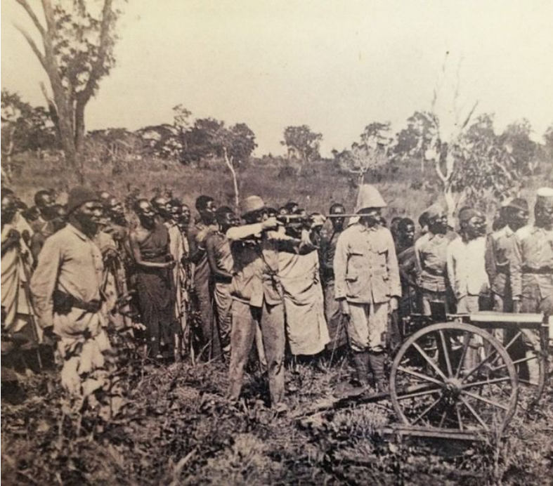
German weapons demonstration in front of Ngoni warriors, 1897