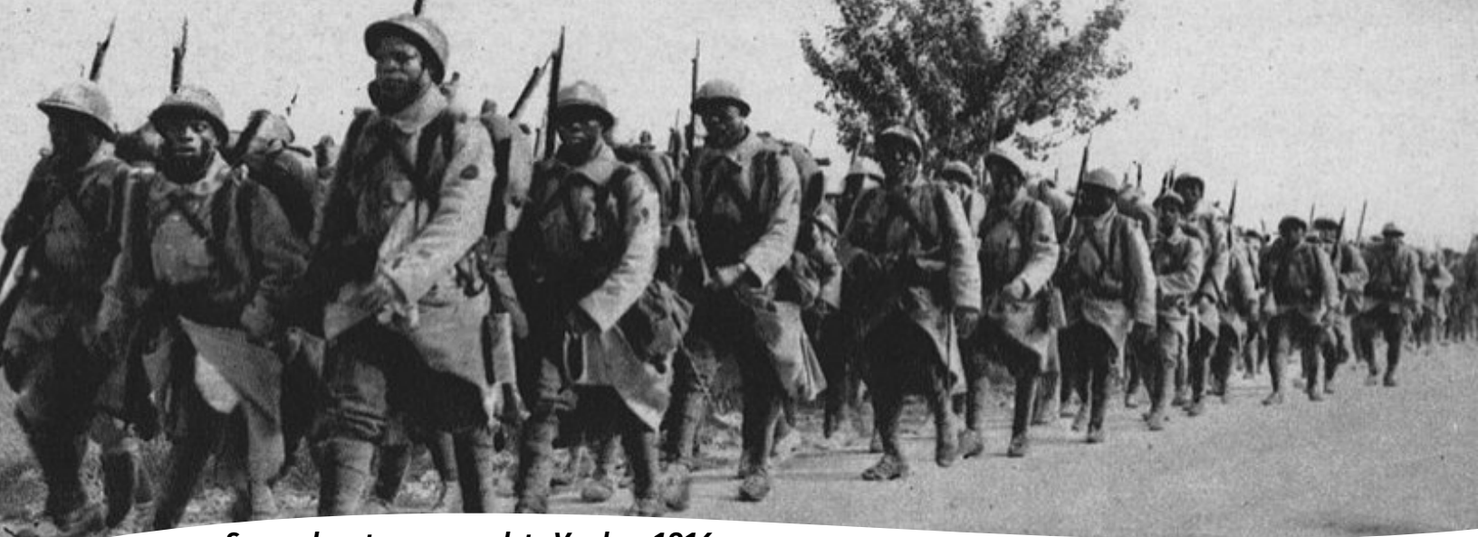
Senegalese troops march to Verdun, 1916

The resultant jealousies and bitter hatreds tend continually to fester along the color line. We must fight the Chinese, the laborer argues, or the Chinese will take our bread and butter. We must keep Negroes in their places, or Negroes will take our jobs. All over the world there leaps to articulate speech and ready action that singular assumption that if white men do not throttle colored men, then China, India, and Africa will do to Europe what Europe has done and seeks to do to them.