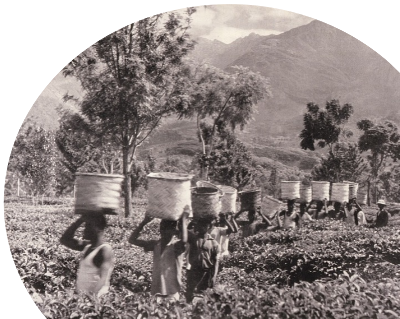
Tea plantation in Nyasaland