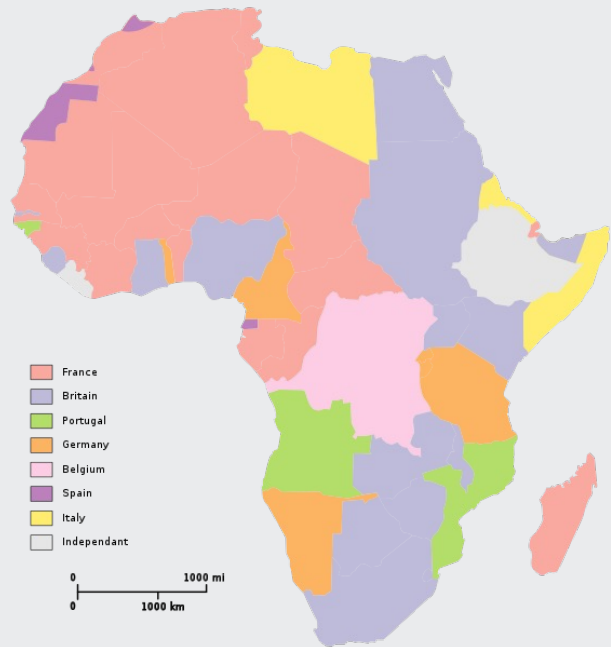
Colonial claimants to Africa, 1913