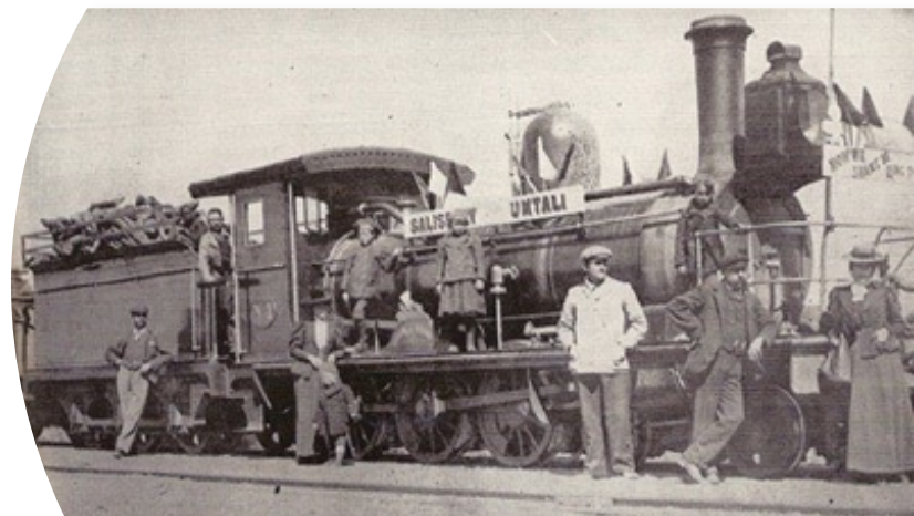
Railway opening in Africa, 1899

The methods by which this continent has been stolen have been contemptible and dishonest beyond expression. Lying treaties, rivers of rum, murder, assassination, mutilation, rape, and torture have marked the progress of Englishman, German, Frenchman, and Belgian on the dark continent. The only way in which the world has been able to endure the horrible tale is by deliberately stopping its ears and changing the subject of conversation while the deviltry went on.